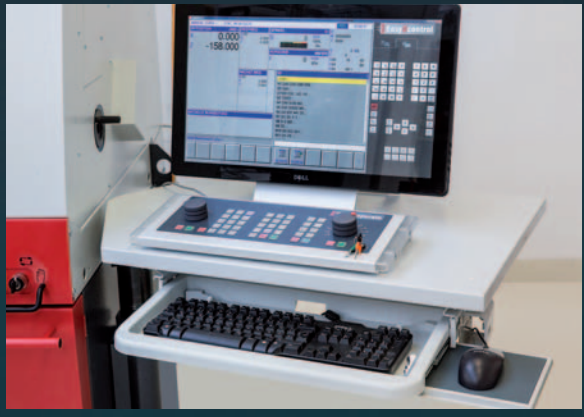
Easy2control with Easy2operate

To operate the software on the Concept machine a license dongle and a small machine control panel - "Easy2operate" – is required.