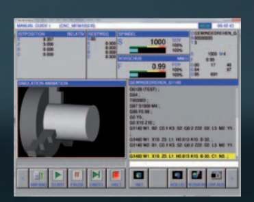
Simple to program using the EMCO WinNC control units