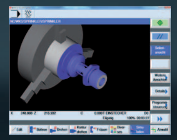
Simulation suitable for training using Win3D-View