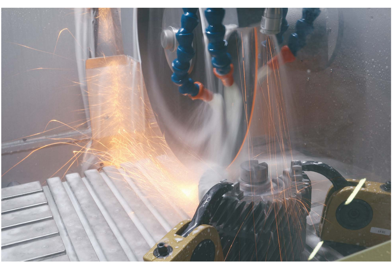
Fast cutting with efficient cooling

For cutting larger specimens that cannot be cut in one cycle. Y and Z axis are combined for additional cutting capacity. First the cutting is performed with Z-axis chop cutting, subsequently the specimen is cut with Y-axis Table-feed.