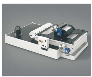
BANDCOOL, Band Filter Unit

Cleaning & Maintenance is an important job and can be time-consuming. The AutoClean function provides a thorough cleaning of the entire cutting chamber. The AutoClean function reduces operator effort, saves time and lowers maintenance while improving overall operation and accuracy of the instrument. The cleaning gun which is mounted externally for easy access can be used for cleaning the remained residual on horizontal surfaces.