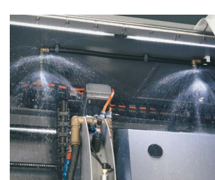
Auto Clean Function