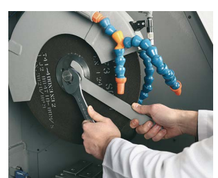
Easy Exchange of Cut Off Wheel