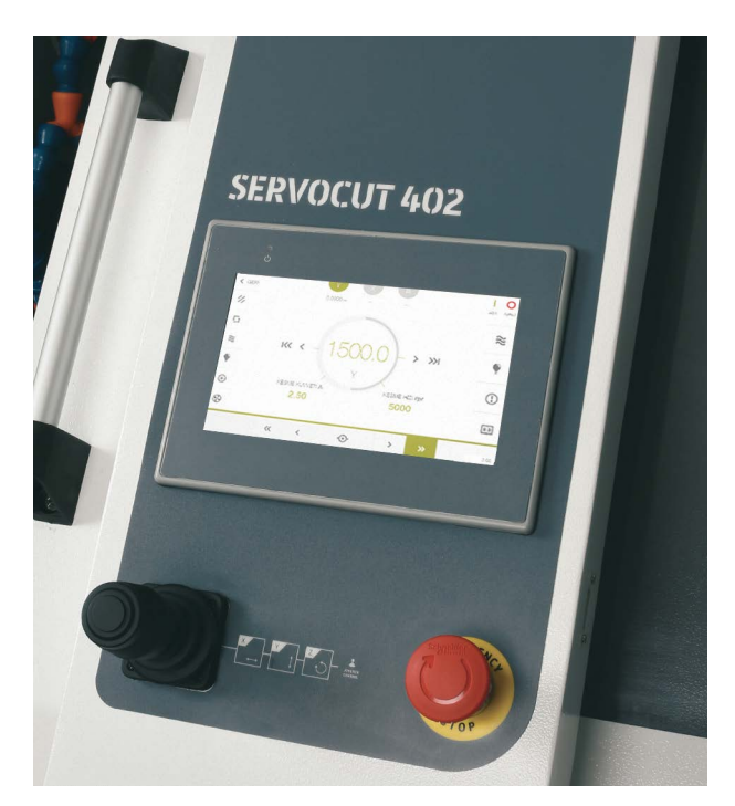
HMI touch screen controls with various cutting methods and database with cutting programs and maintenance monitoring