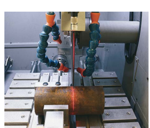
ser Alignment Unit