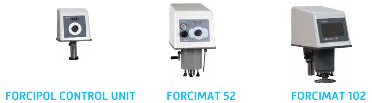
FORCIPOL CONTROL UNIT

FORCIMAT 102: For Programmable Automatic Individual and Central Force Operation