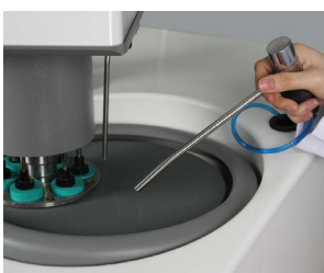
Retractable water hose for easy cleaning

filter entering the grinder / polisher intake. Enviro can also be coupled with line water and 80 micron filtering system for disposal.