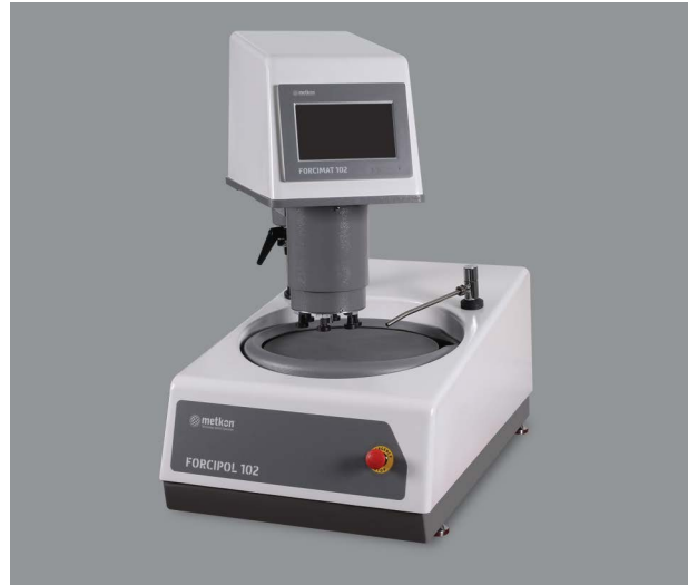
FORCIPOL 102 with FORCIMAT 102

The "soft start and stop" feature automatically starts the sequence with a low initial force which is then increased to the preset. Towards the end of the cycle, the force is automatically reduced to 75 % of the setting to prevent scratching. A variety of sample holders for individual or central force applications are available for different sample sizes. Both individual and central force specimen holders can be removed and inserted easily with the help of quick release chuck. By holding the head button on the software, the specimen holder will rotate for easy insertion and removal of the specimens.