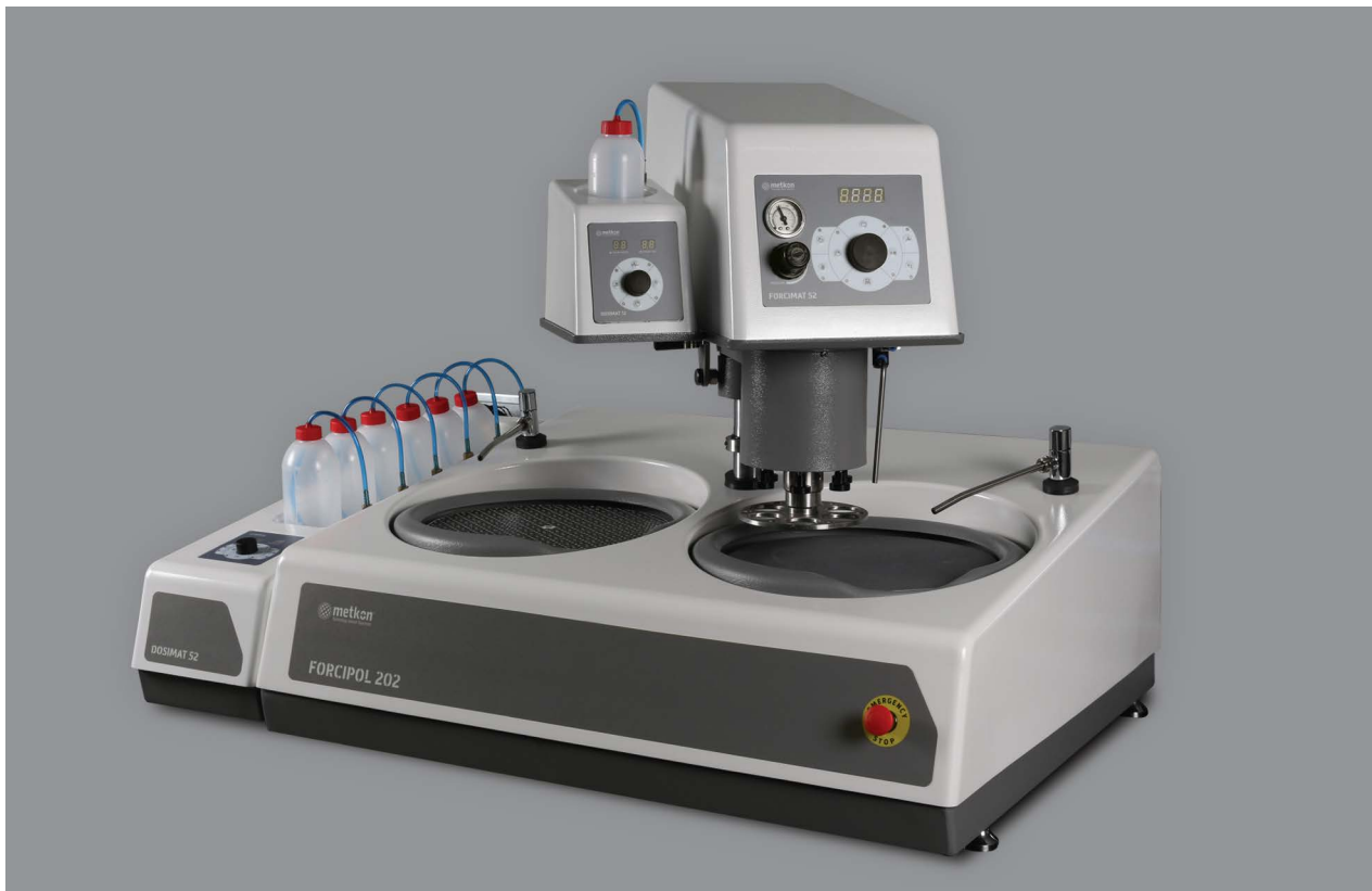
FORCIPOL 202 + FORCIMAT 52 + DOSIMAT 12 + DOSIMAT 52

Dispensing parameters like; frequency, dosing time, fluid selection etc. are controlled through the LCD screen of the FORCIMAT 102 Automatic Head and can be stored in memory.