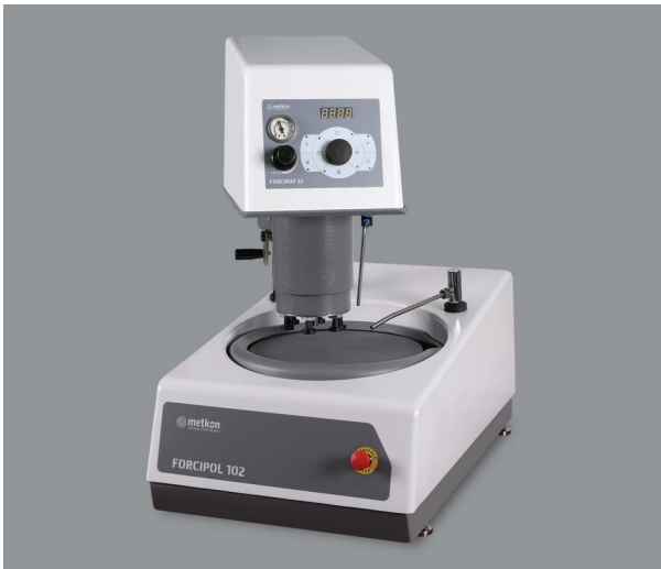
FORCIPOL 102 with Forcimat 52

When needed, FORCIMAT 52 can work in manual mode to allow prepare specimens by hand.