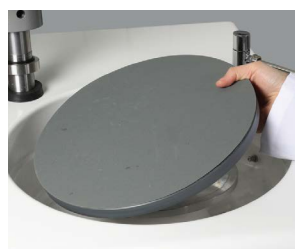
Simple exchange of working discs