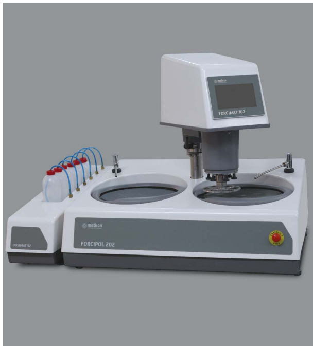
FORCIPOL 202 with FORCIMAT 102 & DOSIMAT 52

Optional encoder allows you to measure the amount of material removed from the surface. The desired grinding depth can be set to grind different type of samples and also for applications that need special accuracy.