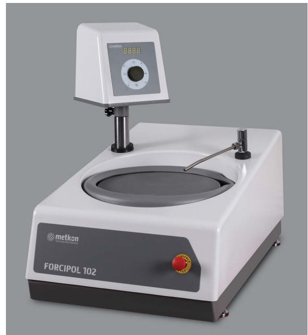
FORCIPOL 102 with Control Unit

Enviro Filter Unit is a closed loop recirculating filter system which is optionally available. It has a 20 lts. reservoir capacity with 1 micron