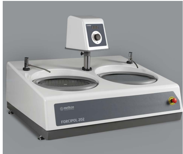
FORCIPOL 202 with Control Unit

Automatic Disc Cleaning & Drying function can be activated with a single button to obtain perfectly cleaned disc surfaces in seconds. Smart Water Saving feature allows tons of water saving over the years.