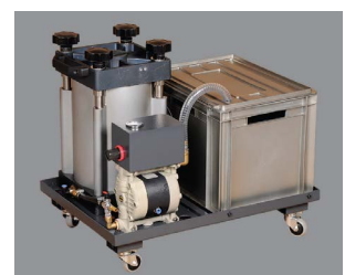
Enviro recirculating filtering unit (1 micron)